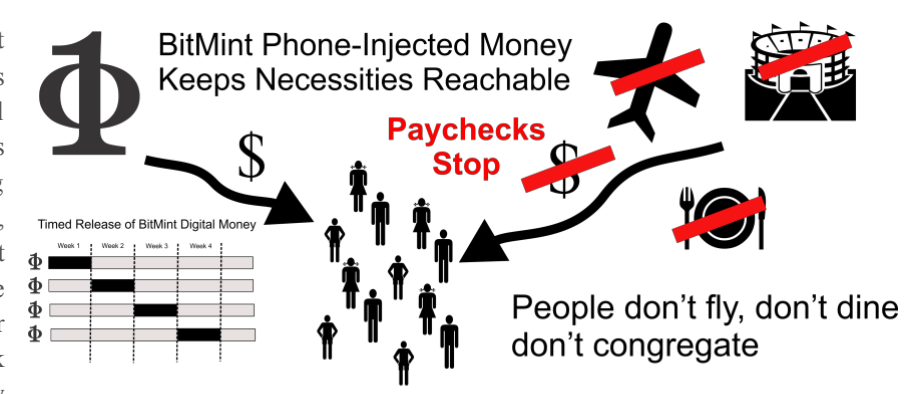
BitMint Coronavirus Emeregency Money

First Prize Winner BitMint Digital Money solution(*), which was built by a major bank(**) for normal business and transactions regimen, is a perfect fit for the fast exploding challenge presented by COVID-19, the Coronavirus. As all entertainment and crowd-intensive businesses are brought to a screeching halt, an ever larger count of people who work there, are left with no income. Many of the laid off have little or no reserve, and live from paycheck to